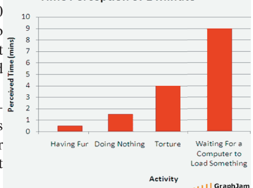
Time Perception of 1 Minute